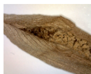
More field of view